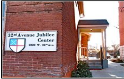
The 32 nd Avenue Jubilee Center has been a constant presence in the Northwest Denver community since 2001.

Serving with compassion & seeking justice for our Northwest Denver neighbors.