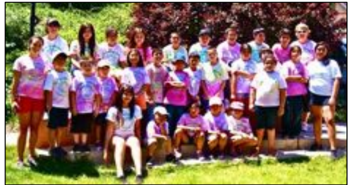
SEEK students on a field trip in summer 2014.